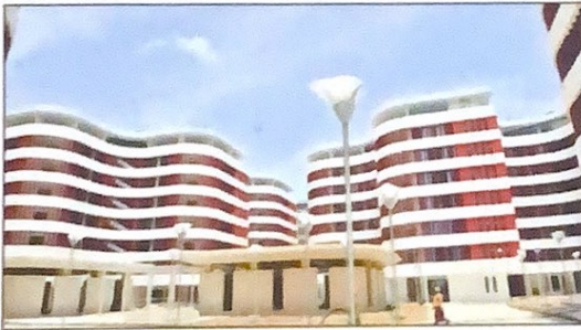
Indian School of Business