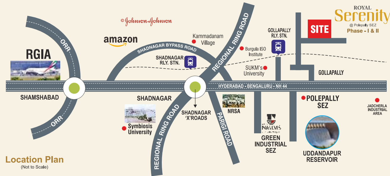
Location Plan (Not to Scale)